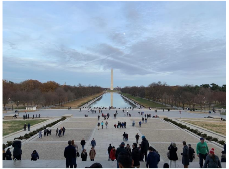
© Dounia Mettri, View from National Mall