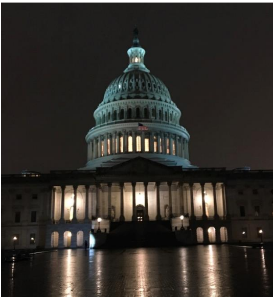
© Dounia Mettri, Wahington DC Capitol