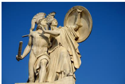
Diomedes and Athena, Schlossbrücke, Berlin

The application was proceeded by the Vivantes Hospital Group itself and not by Charité . It simplified the application process for international students, because every application is handled equally. At Charité , German students had priority in the selection process. So, I just wrote an email to the secretary office of the Department of Radiology . The rest of the application process after receiving the confirmation was very well organized and there were no complications.