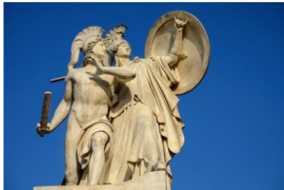
Diomedes and Athena, Schlossbrücke, Berlin

The application was proceeded by the Vivantes Hospital Group itself and not by Charité . It simplified the application process for international students, because every application is handled equally. At Charité , German students had priority in the selection process. So, I just wrote an email to the secretary office of the Department of Radiology . The rest of the application process after receiving the confirmation was very well organized and there were no complications.