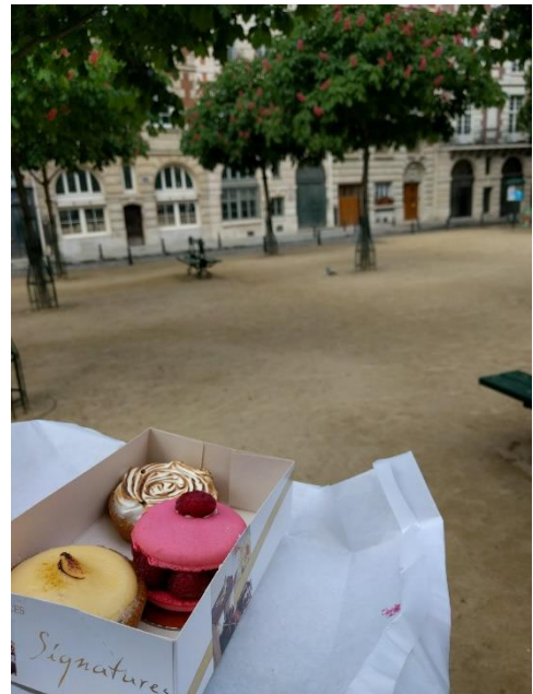
Paris' bakeries are incomparable throughout the world, Paris June 2017

Published in GI-Mail 06/2018 (German edition), ISSN: 2312-0827, Going International, Vienna 2018