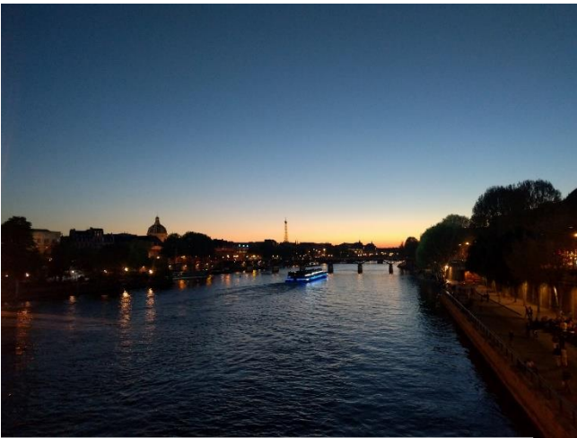
Paris at night next to the Seine, Paris May 2017