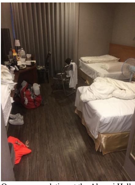
Our accommodation at the Alumni Hall