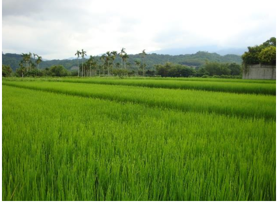
Some awesome rice fields we saw on our trip

Downloaded from www.goinginternational.eu. Copyright © 2017 Going International information services G.Polak KG. All rights reserved.