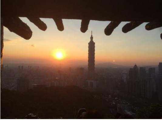
On top of elephant mountain with a view at Taipei 101