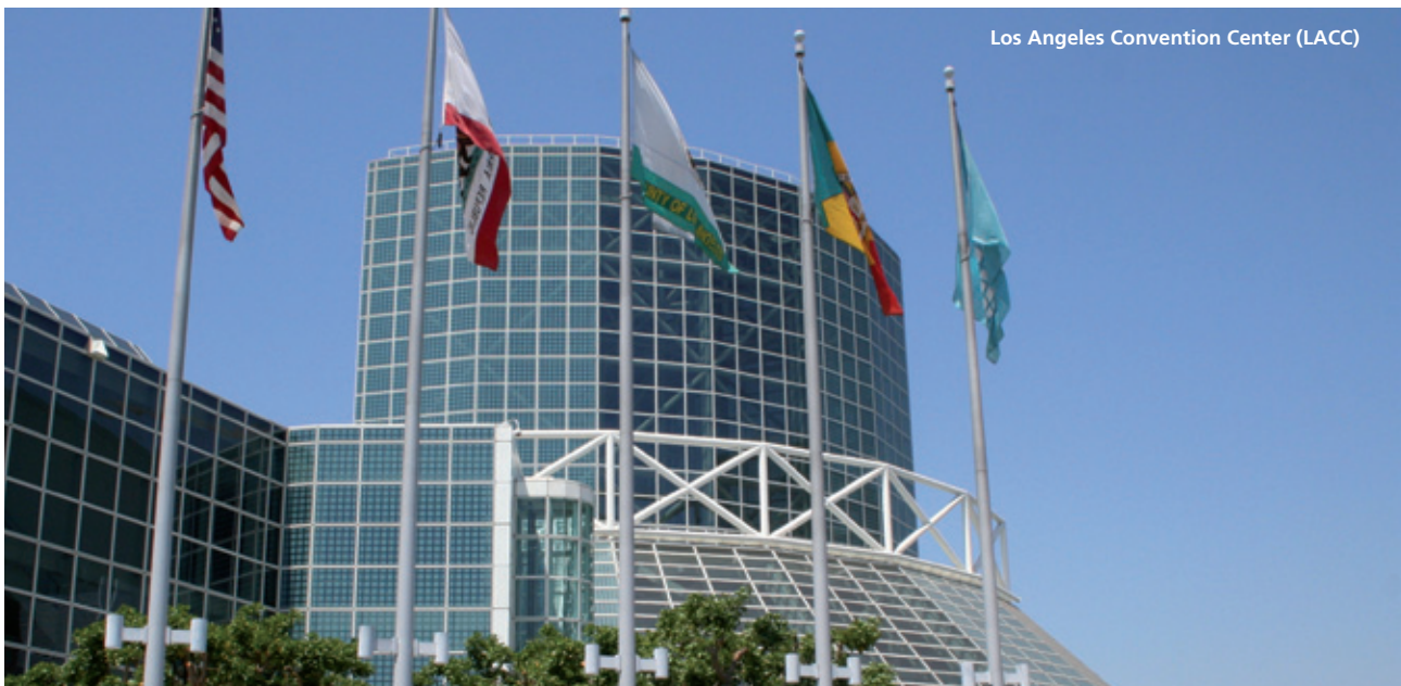
Los Angeles Convention Center (LACC)

Office Berlin CPO HANSER SERVICE GmbH Paulsborner Str. 44 14193 Berlin, Germany Phone: +49–30–300 669 0 Fax: +49–30–305 73 91 Email: ice2011@cpo-hanser.de